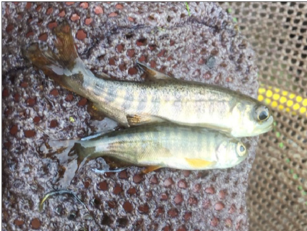
Figure 1.—Juvenile coho salmon captured at waypoint 1028.