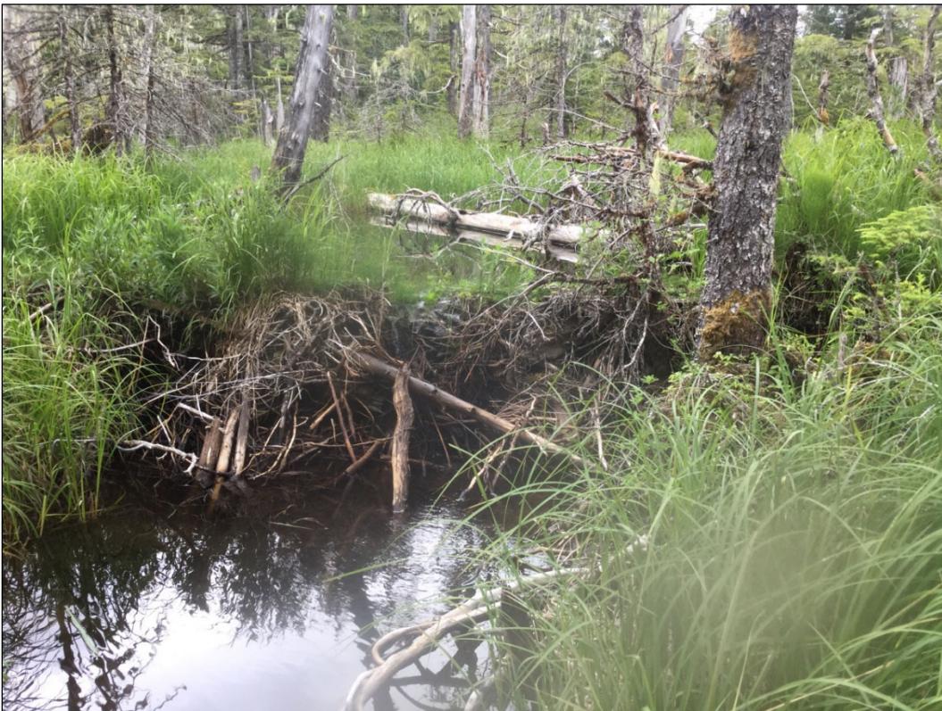
Figure 3.—Beaver dam with ponding above at waypoint 1041.