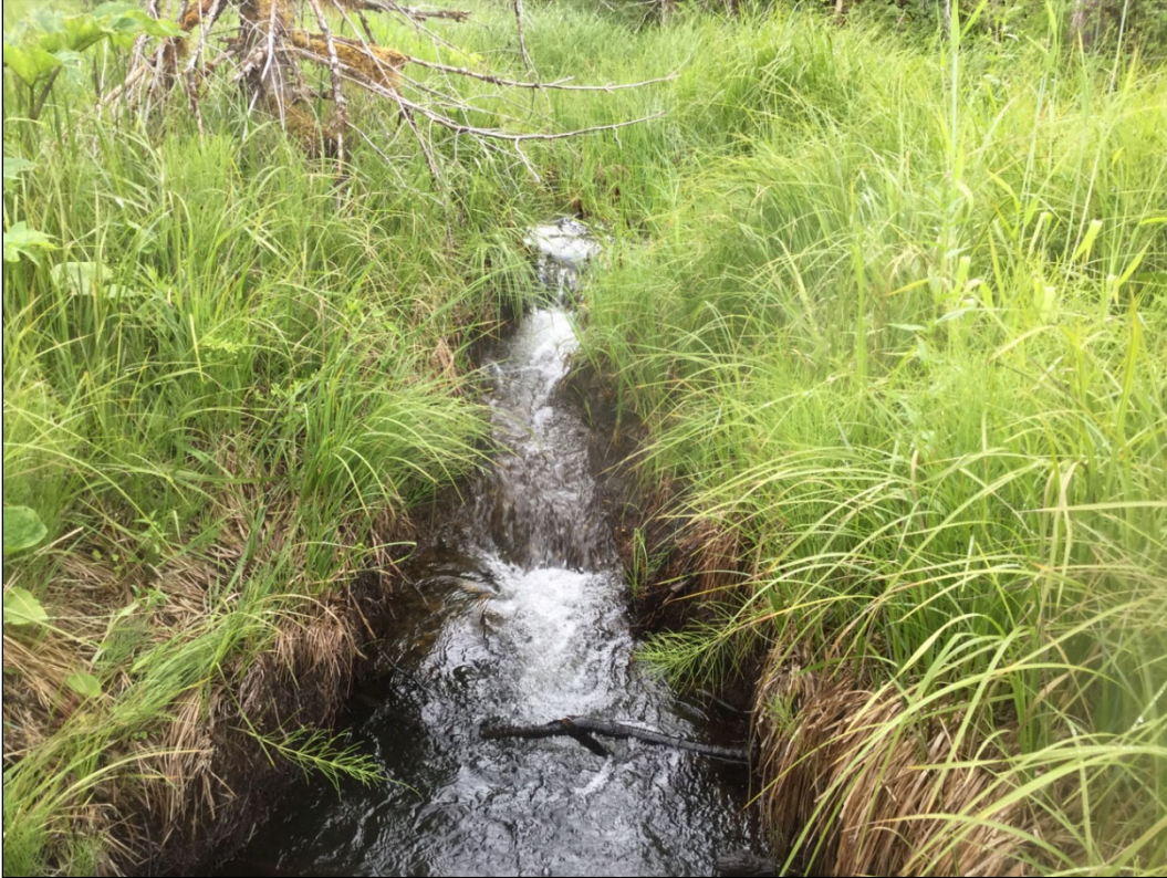
Figure 2.—Channel at waypoint 1028.